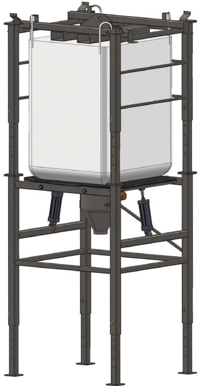
BBU-FL Model Shown